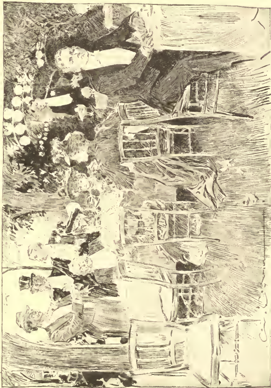
A man was talking; he spoke in English, with an accent.